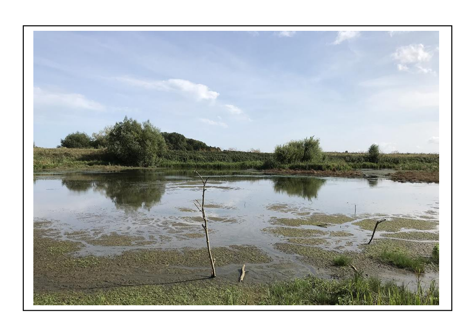
Top Hill Low wetland habitat

The woodland areas surrounding the reservoirs are alive with breeding warblers during spring, with Garden Warblers and Willow Warblers in the scrub and woodland alongside Reed Warbler and Sedge Warblers in the wetter areas. Otters are secretive and tricky to spot but they are seen all year round. From spring into summer, the reserve is an ideal place to spot Early Marsh and Bee Orchids, Dragonflies and Damselflies.