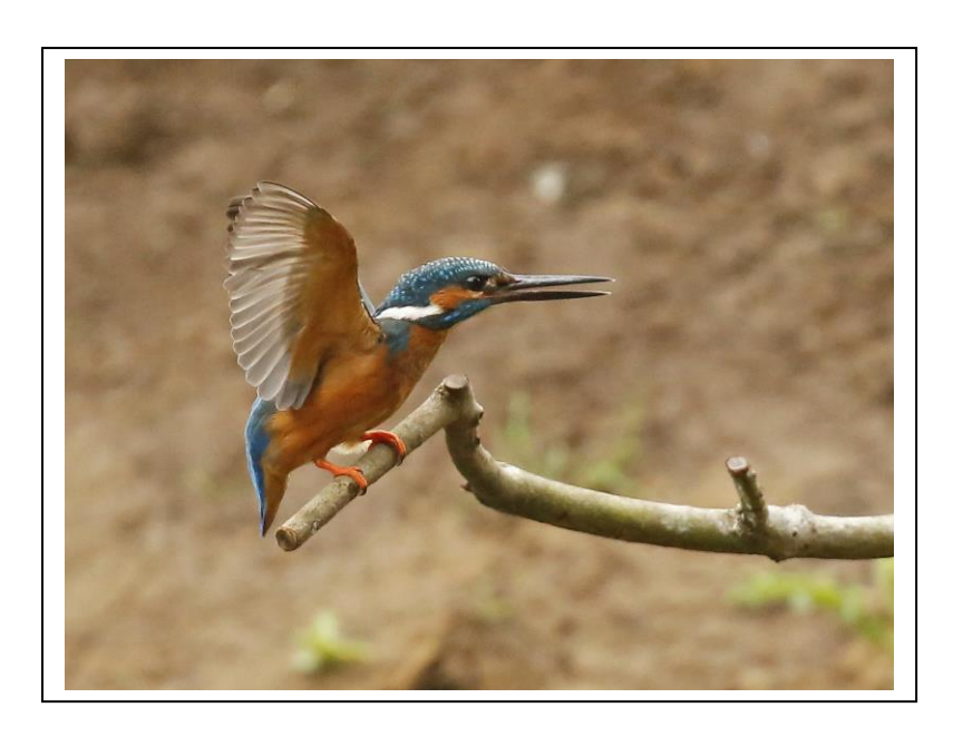
Common Kingfisher Top Hill Low

here at this time of the year. Keep your eyes peeled for Common Kingfisher , Marsh Harrier , Western Barn Owl , Water Rail and Cetti's Warbler too.