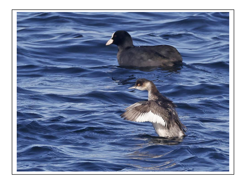
Coot and Black-necked Grebe Top Hill Low