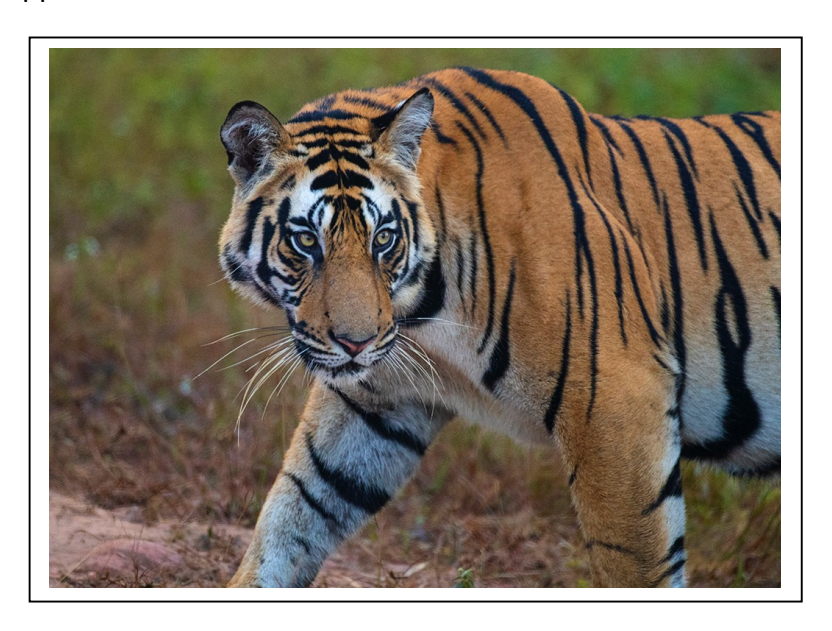
Bengal Tiger India 2019 - photo by Steve Race - November 2019

Our first full day of photography and bird watching inside Ranthambore National Park with packed lunch supplied from the hotel.