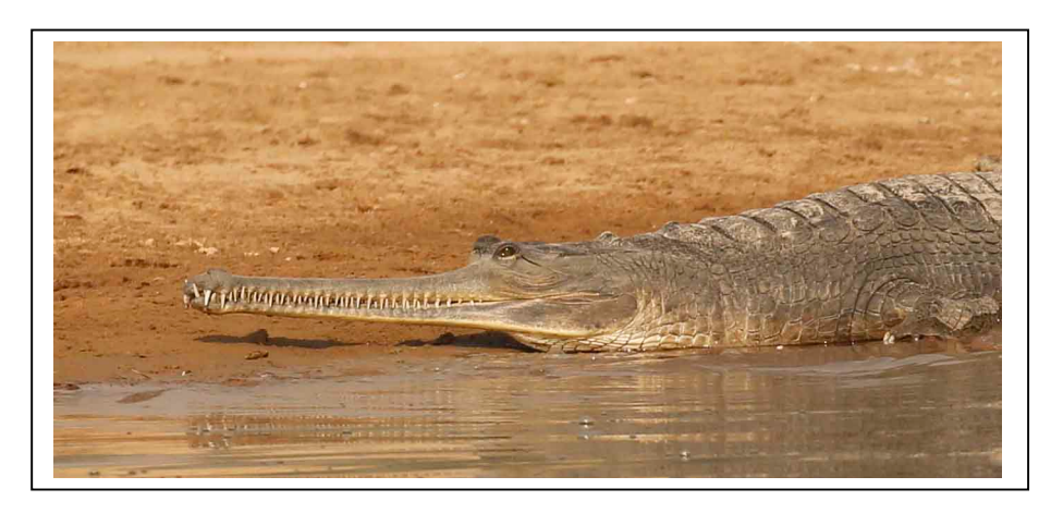
Garial – fish eating crocodile on Chambal River - February 2019

An early morning drive north to the wonder of Chambal River followed by a two-hour boat safari on the river guided by our local expert naturalist. Here birds such as River Tern and Indian Skimmer mingle with Gharial, a fantastic fish-eating crocodile, Mugger Crocodiles and if we are lucky, we may even see a rare Gangetic Dolphin.