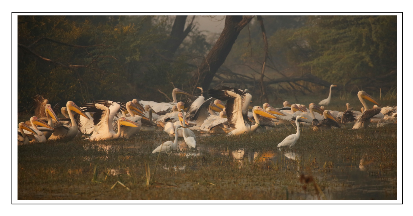
Pelican and Egret feeding frenzy. Keoladeo NP - photo by Richard Baines February 2018

Our third full day of photography and bird watching inside Keoladeo National Park with packed lunch supplied from the hotel. The three days in Keoladeo allow us time to really drink in the experience and get to see as much of the wildlife as possible.