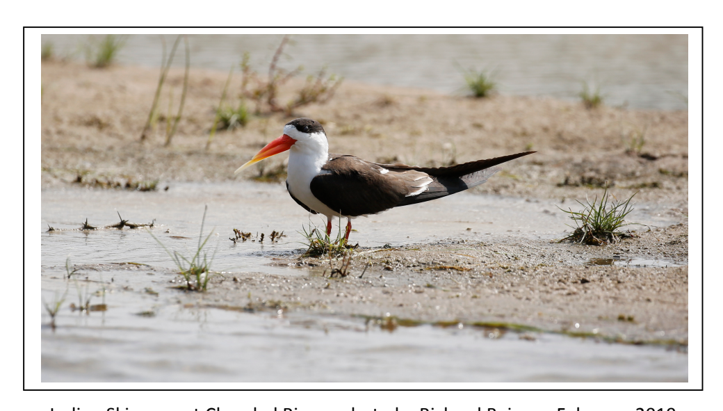
Indian Skimmer at Chambal River - photo by Richard Baines - February 2019