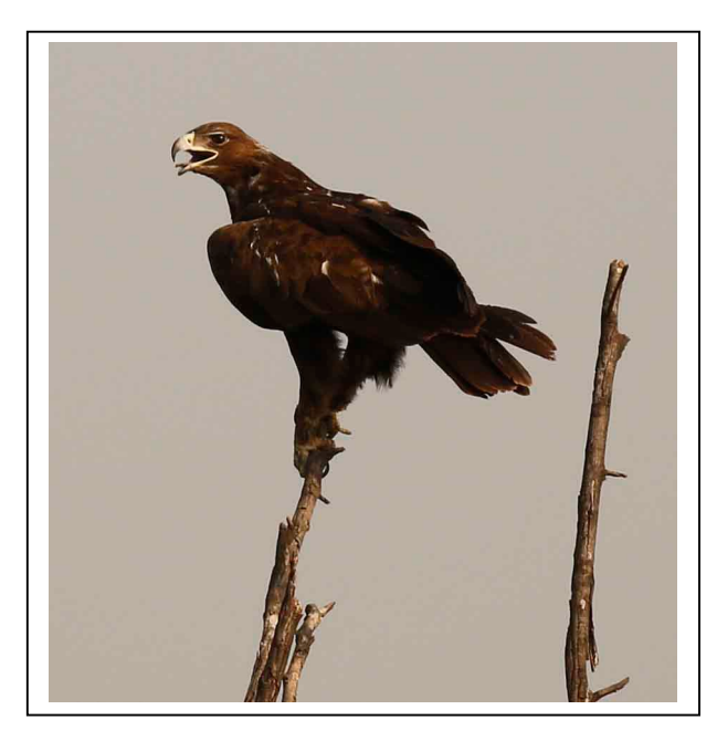
Greater-spotted Eagle – Keoladeo NP February 2018