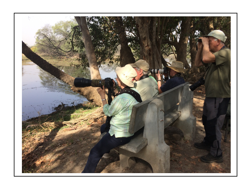
YCN-Indus Experience tour guests enjoying another great day in India 2018