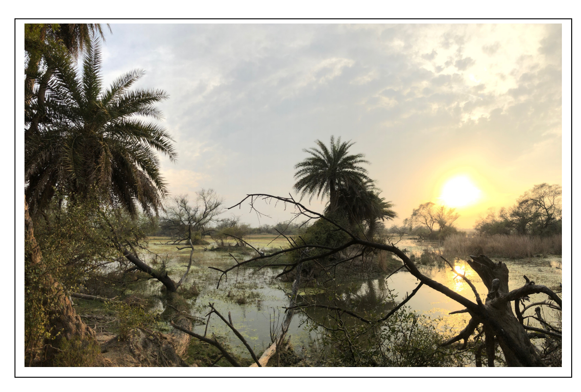
Sunset over the magnificent wetlands of Keoladeo NP Feb 2019

India is one of the top countries in the world for birding and wildlife photography. It really is teeming with wildlife wherever you go. From wild boars wandering through the centre of towns to the amazing jungles full of birds and tigers! On this tour we will visit two national parks we are familiar with from previous trips led by Steve and Richard. Keoladeo National Park on the edge of Bharatpur is one of the most important wetlands in the world for birds and then we travel to Ranthambore National Park one of the top tiger sites in the world. This is going to be a great wildlife combo!