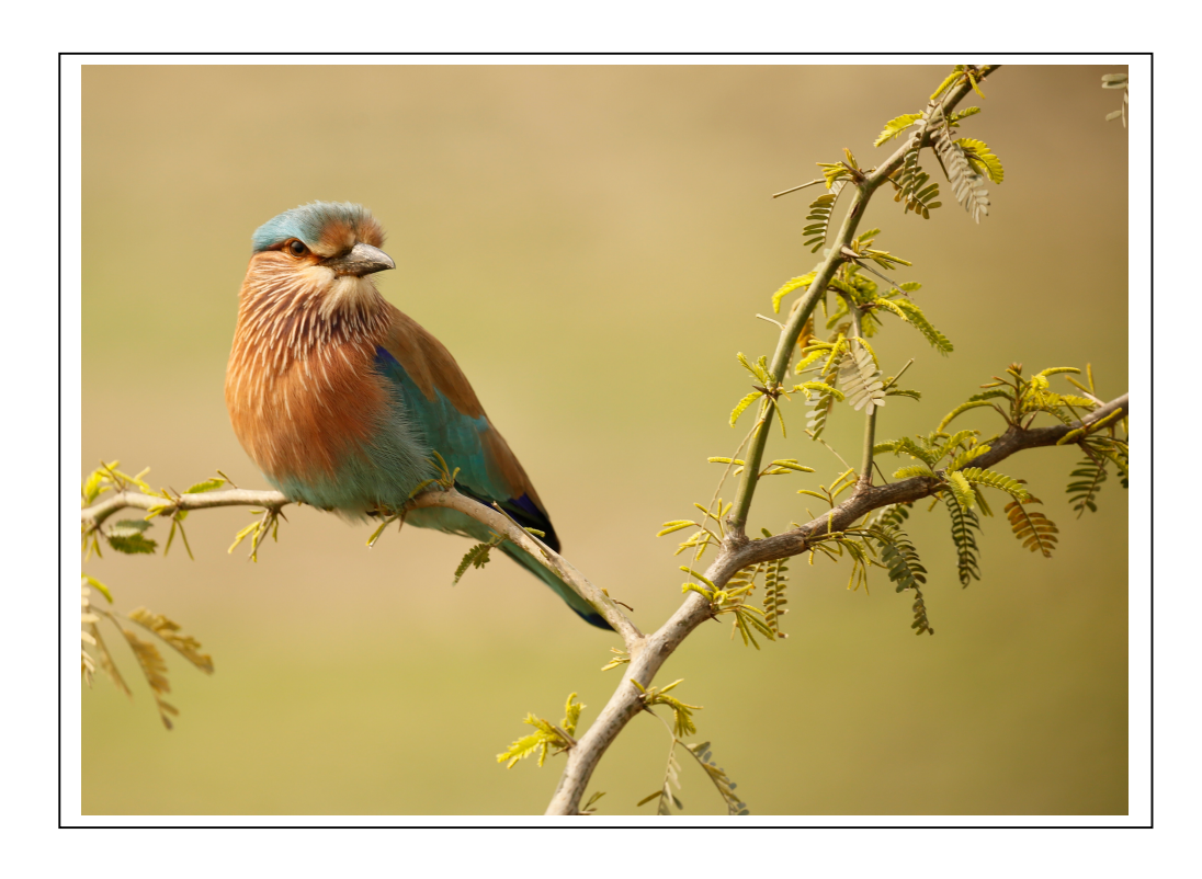
Indian Roller - photo by Richard Baines - February 2019