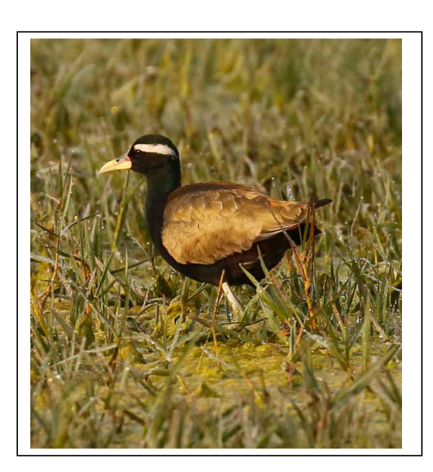
Bronze-winged Jacana – Keoladeo NP - February 2018