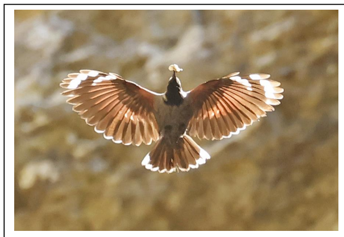
Wallcreeper Transylvania 2023

A large variety of waders, ducks and herons are present at the fishponds in spring, and some of the species we'll be looking for here include all three species of marsh terns, ( Whiskered, Black and White-winged ), Ferruginous Ducks, European Bee-eaters, Eurasian and Little Bitterns, Broad-billed Sandpiper and Lesser Spotted Eagle ; we'll take our packed lunch here and we'll drive back to the guesthouses in the afternoon. After a rest and freshen-up we'll have an early dinner at 1800hrs, after which we'll spend the evening searching for owls via a drive and walk – looking and listening for Ural Owl, Long-eared Owl, Scops Owl, Tawny Owl, Nightjar and Woodlark .