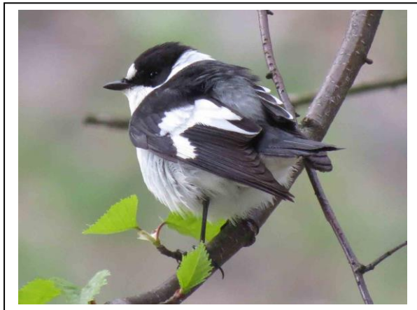
Collared Flycatcher 2023 © The Milvus Group

At the fishponds we can expect to enjoy many wetland species, including herons, ducks, and waders; Ferruginous Ducks and Pygmy Cormorants are the highlights of the area, but we'll also be looking for raptors such as White-tailed and Lesser Spotted Eagles . We'll return to the Miklósvár guesthouse by 16:30, and part of the team will visit the Brown Bear hide after a break, returning for a late dinner; the other half of the team will enjoy a birding afternoon in the nearby meadows and forest with dinner on return.