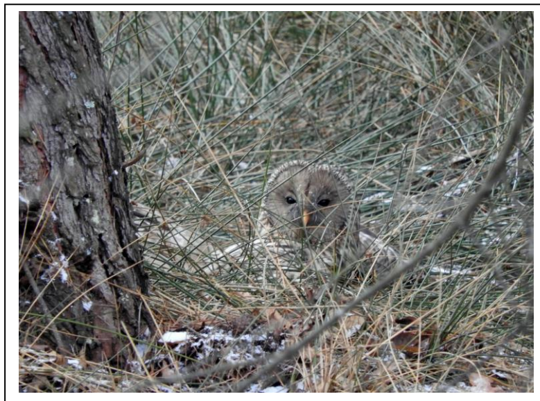
Ural Owl

Species we'll be looking for include Ural Owl, Collared, Red-breasted and Spotted Flycatchers, Green, Grey-headed and Black Woodpeckers, Wrynecks, Honey Buzzard, Lesser Spotted Eagle and Black Stork. We will have our packed lunch in beautiful surroundings, continuing our journey and returning to the Guesthouses by 1600hrs. Because this will be our final evening at Miklósvár Guesthouses, we'll offer an (optional) talk before dinner, all about Romanian birds, their conservation and Milvus Group's achievements will be presented.