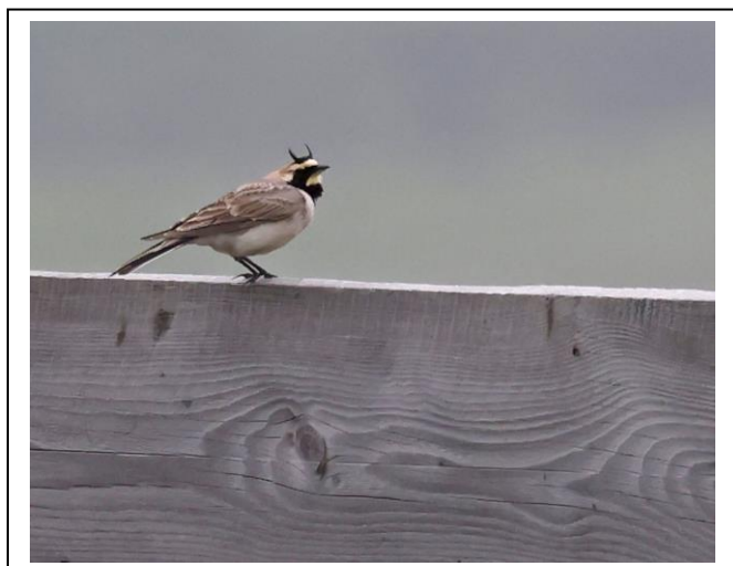
Horned Lark Sinaia 2023

The cable car will take us back to town, where the minibus will pick us up and we will be back to Miklósvár Guesthouses for early evening.