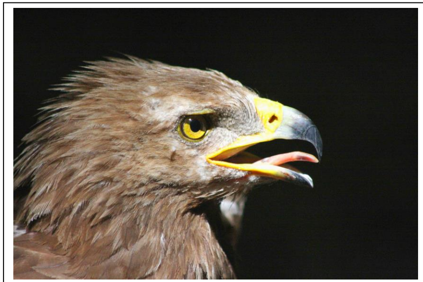
Lesser Spotted Eagle

This is a rare opportunity to experience the wildlife of an iconic region at a relaxed pace whilst directly helping a local conservation organisation.