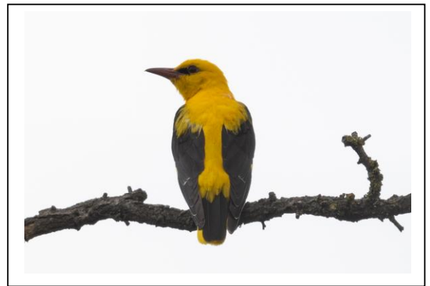
Golden Oriole 2023 © The Milvus Group