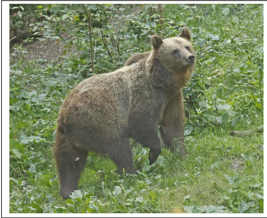
Brown Bear Transylvania 2023